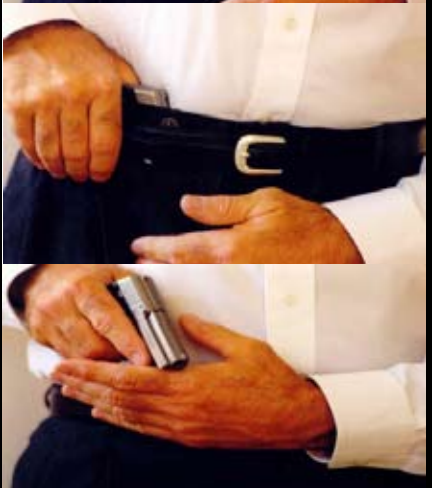
Carry a handgun IWB without a holster, case or pouch.

CovertCarrier is The Gold Standard for Total Weapons Concealment!